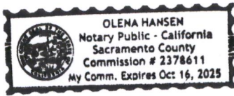
Place Notary Seal and/or Stamp Above

Signature [Signature] Signature of Notary Public