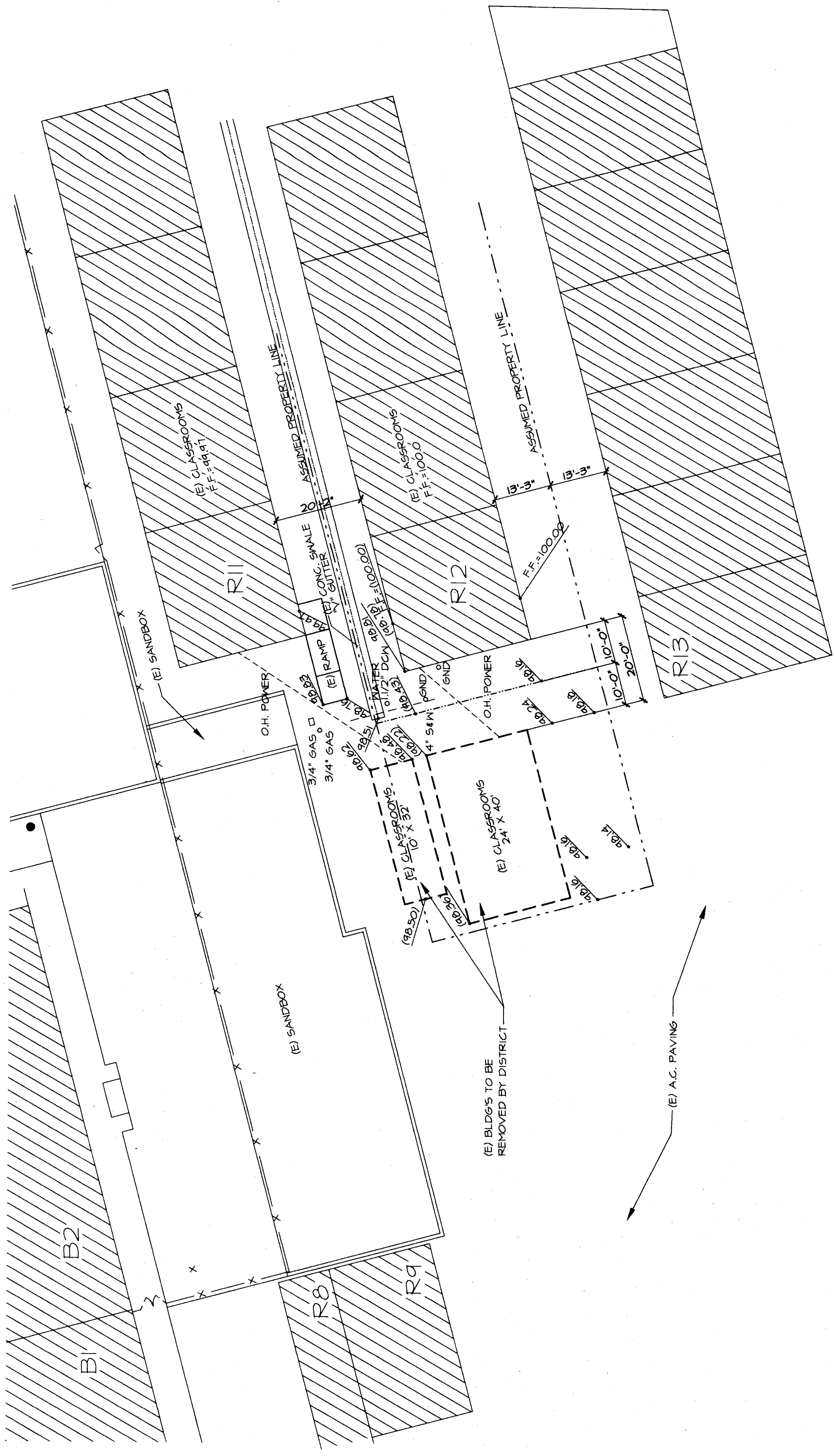
EXISTING TOPO PLAN - FREMONT SCALE: 1" = 20'-0" PLAN NORTH

LEGEND [Hatched Box] BLDGS NOT PART OF THIS CONTRACT [Dashed Box] REJ BLDGS TO BE REMOVED BY DISTRICT [Line with 'x'] REJ CHAIN LINK FENCE