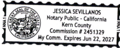
Place Notary Seal and/or Stamp Above

Signature J. Sevillanos Signature of Notary Public