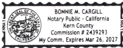
Place Notary Seal and/or Stamp Above

I certify under PENALTY OF PERJURY under the laws of the State of California that the foregoing paragraph is true and correct. WITNESS my hand and official seal.